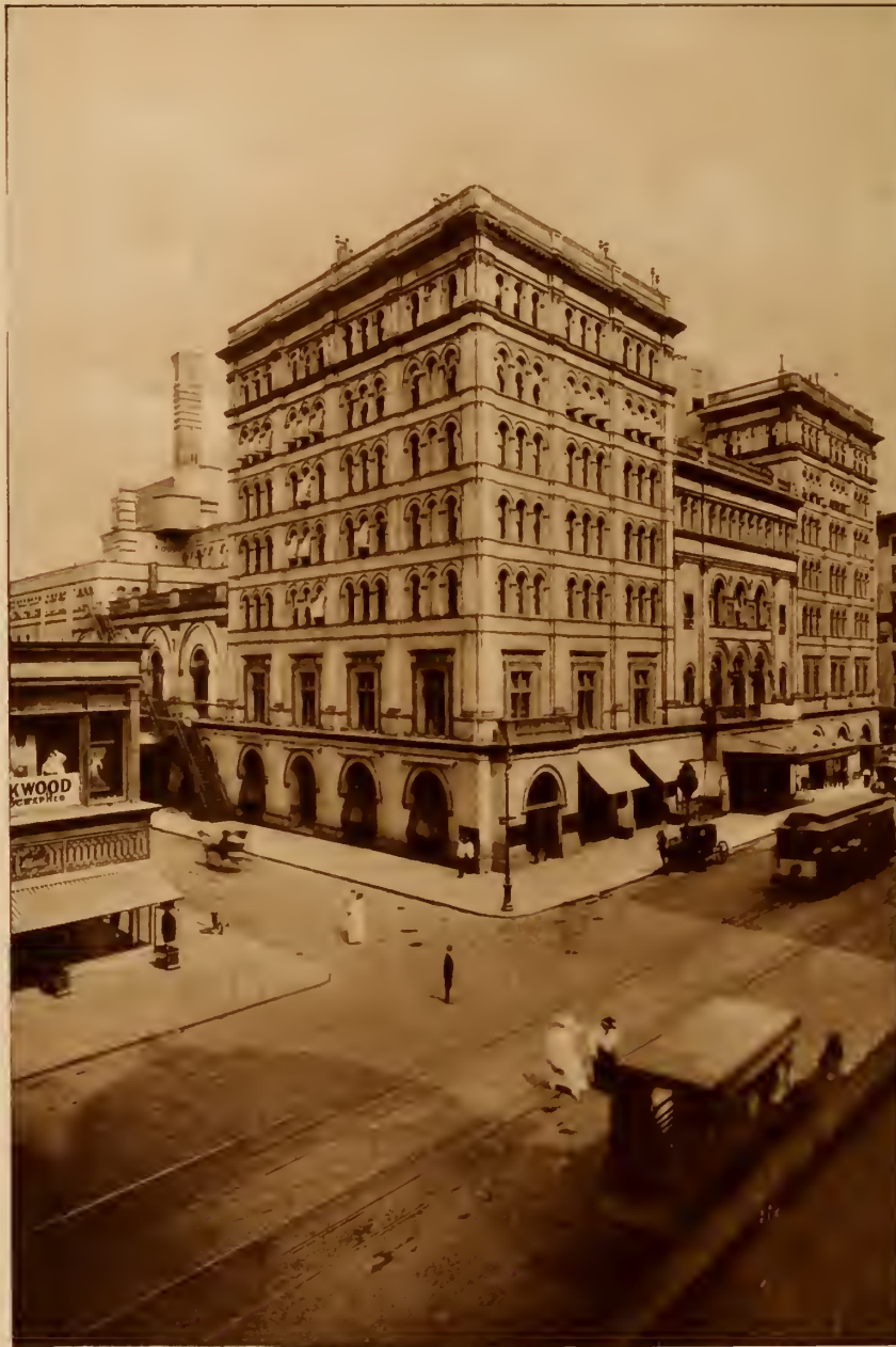
METROPOLITAN OPERA HOUSE. One of the most famous Opera Houses in the world. It is supported by many of New York's wealthy residents.